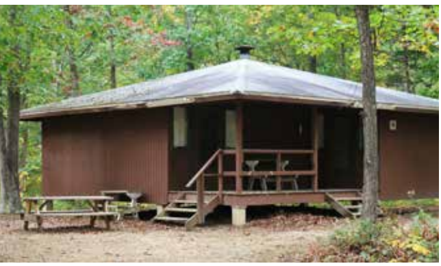
Cabin with Toilet/Sink and Bunks