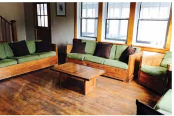
The Farmhouse living room