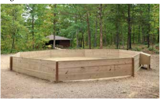
Gaga Ball Pit